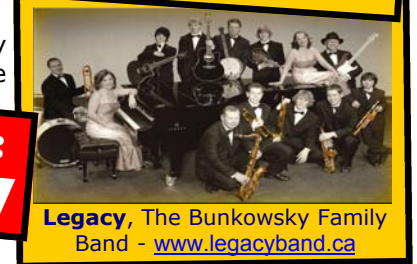
Legacy, The Bunkowsky Family Band - www.legacyband.ca

Memorial Website: http://homepage.mac.com/ftwiebe/tj