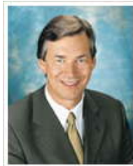
Gary Doer Premier