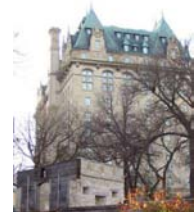
THE FORT GARRY