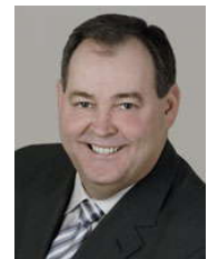
Raymond Simard MP